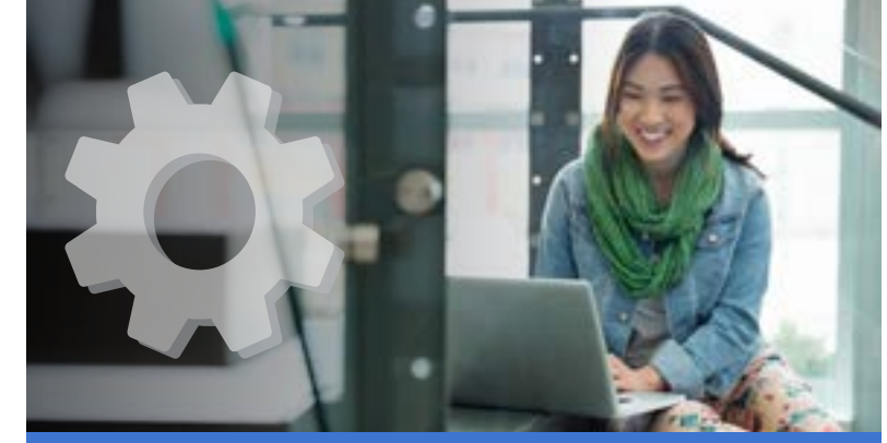
Discovery & Technology