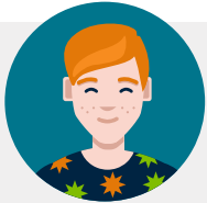
Liam Elementary School Student

Click on a persona below to learn more about how LearningExpress can help them achieve their unique goals.