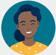
Lucy Middle School Student