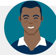
Marcus University Student