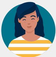
Maya Community College Student