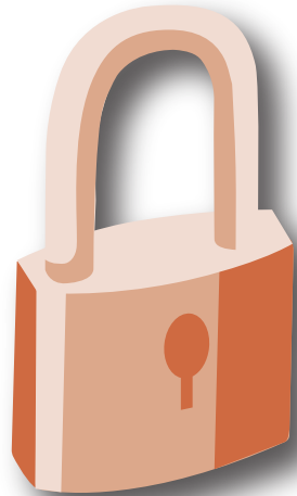
Tools for DIY, Hobbies and Makerspaces