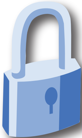
Resources to Foster a Lifelong Love of Reading

Click on any category to unlock the solution: