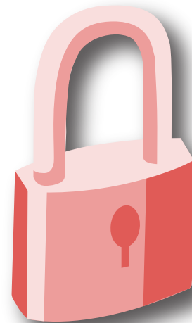
Marketing and Collection Management Tools