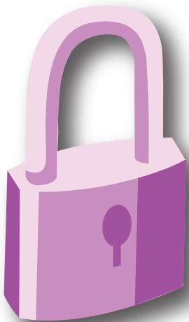
Language and Literacy Materials