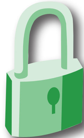
Job and Career Resources